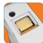
Safety sliding shutters