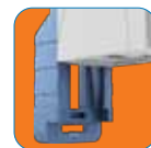
Two position DIN rail clamp