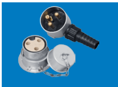
MCB PROTECTED SOCKET